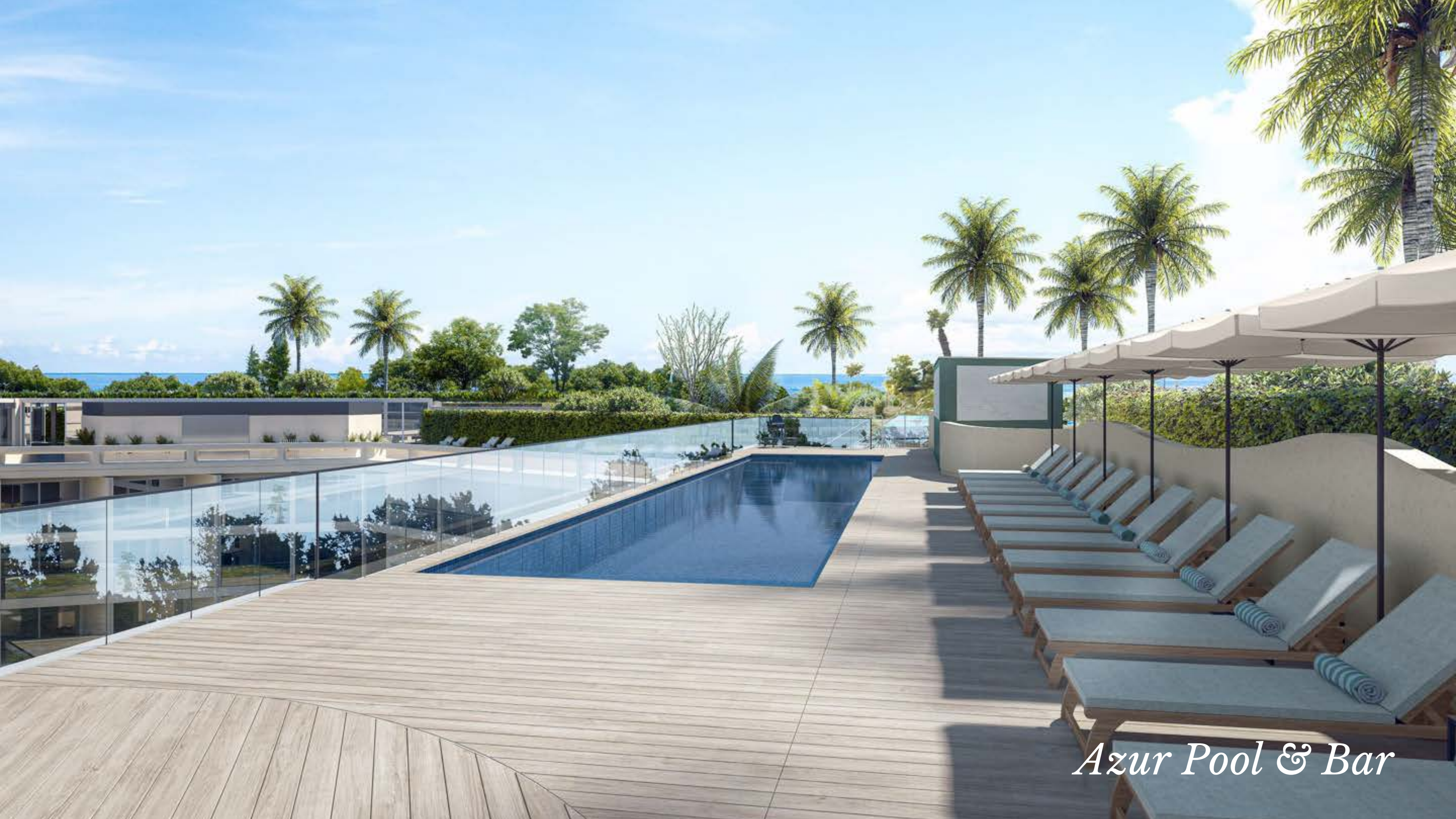
Azur Pool & Bar